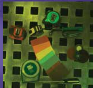
9000X ADF Shade 3