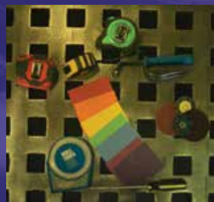
9002NC ADF Shade 3

Improved optics in the Speedglas 9002NC welding filter helps you see your welds in a new light, providing more contrast and natural-looking color as shown in these photos.