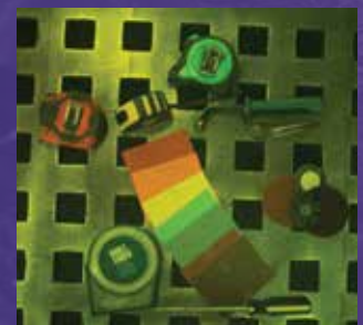
Sample Competitor ADF Shade 3